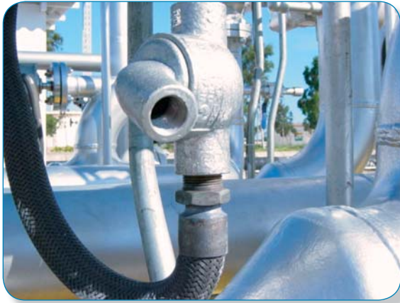
Fig. 3: The sealing unit II.