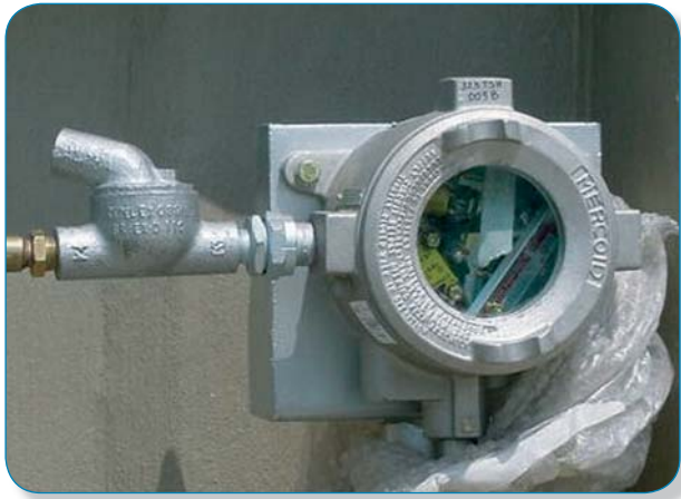
Fig. 1: The sealing unit.